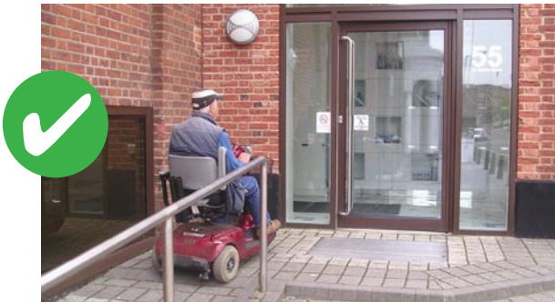
✓ Ramp with rail to entrance