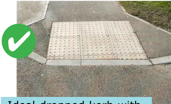
✓ Ideal dropped kerb with tactile surface